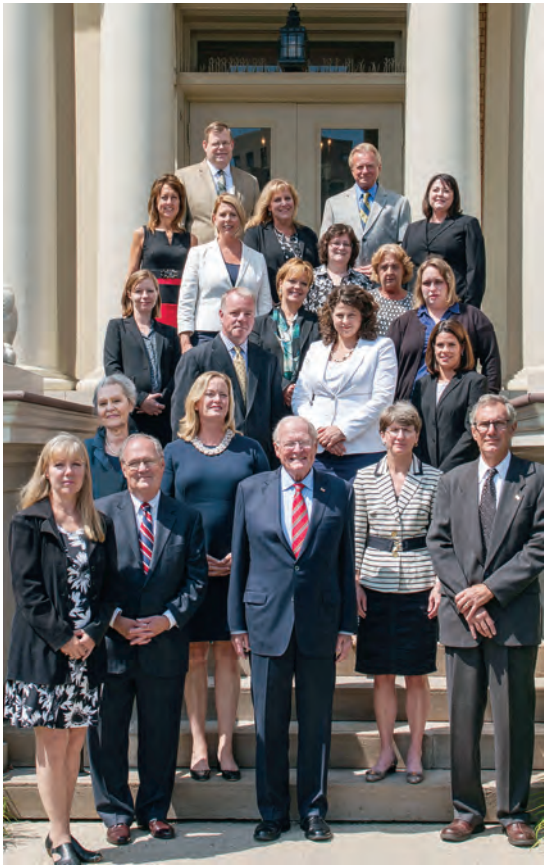
The Lynde and Harry Bradley Foundation Staff