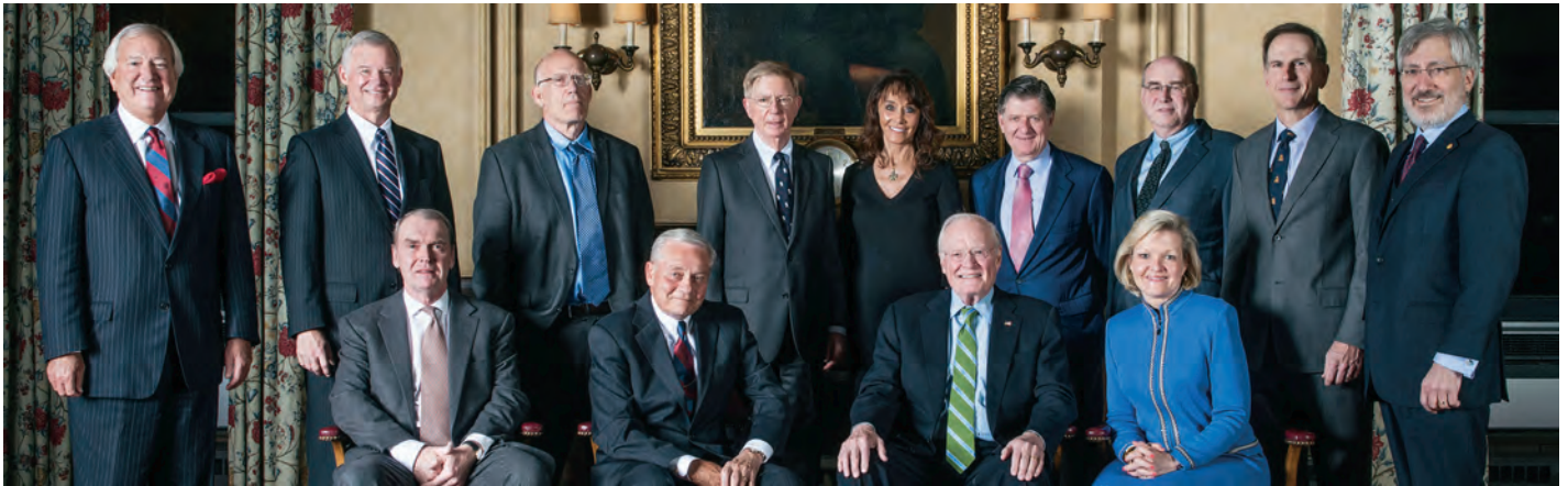
Board of Directors of The Lynde and Harry Bradley Foundation, Inc.