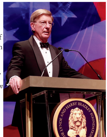
George Will, Master of Ceremonies