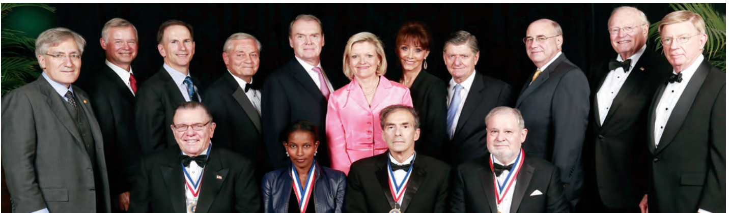
Bradley Directors with the 2015 Bradley Prizes award recipients