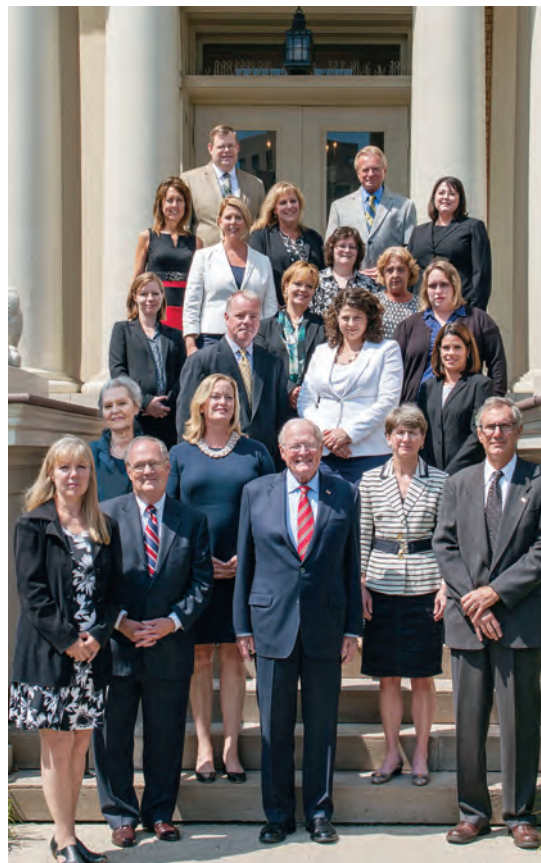
The Lynde and Harry Bradley Foundation Staff