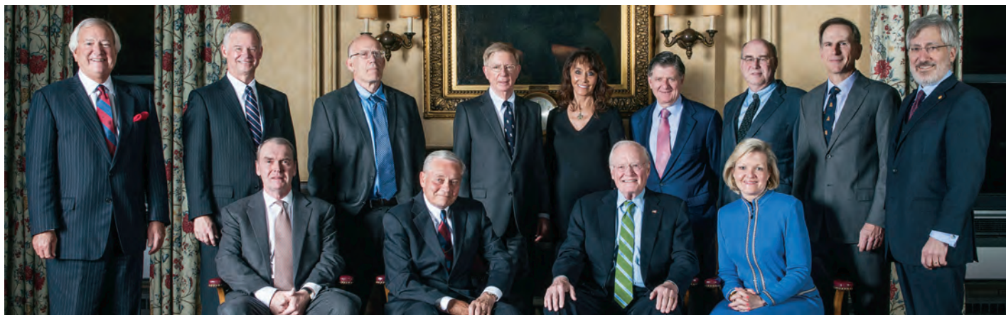
Board of Directors of The Lynde and Harry Bradley Foundation, Inc.