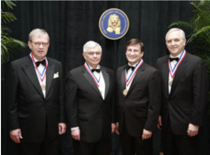
2010 Bradley Prizes award recipients