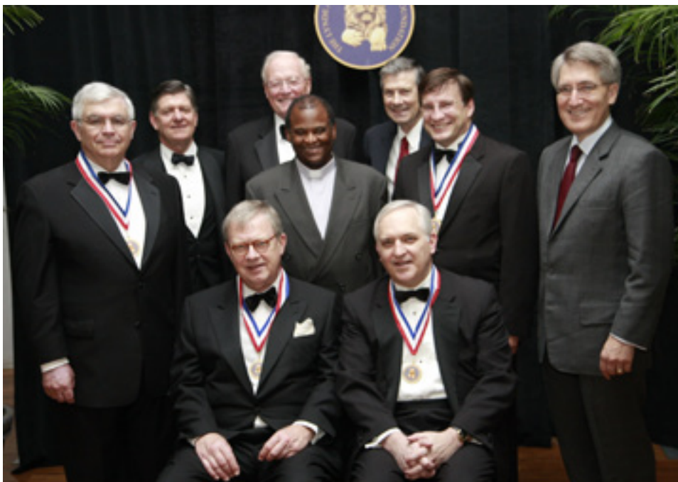
Bradley Directors with the 2010 Bradley Prizes award recipients

John Taylor is the Mary and Robert Raymond Professor of Economics at Stanford University. He is also the George P. Shultz Senior Fellow in Economics at the Hoover Institution on War, Revolution and Peace and a Senior Fellow at the Stanford Institute for Economic Policy Research. A leading expert on monetary policy, fiscal policy, and international economics, Professor Taylor served as Undersecretary of the Treasury for International Affairs from 2001 to 2005. His book Global Financial Warriors: The Untold Story of International Finance in the Post-9/11 World chronicles that period. In his landmark 1993 paper Discretion versus Policy Rules in Practice , Professor Taylor proposed the celebrated "Taylor Rule," which is used by central banks worldwide as a guide to setting interest rates. A champion of the role of free markets and rules-based policies for achieving long-term economic growth, Professor Taylor is the author most recently of Getting Off Track: How Government Actions and Interventions Caused, Prolonged, and Worsened the Financial Crisis (2010). He is also co-editor of Ending Government Bailouts as We Know Them (2010).