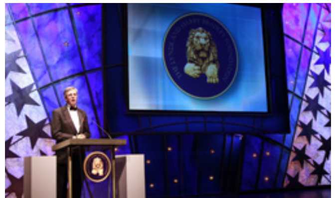
Brit Hume, Master of Ceremonies

Michael Barone is the Senior Political Analyst for The Washington Examiner and Resident Fellow at the American Enterprise Institute for Public Policy Research. He is also a syndicated columnist and commentator on U.S. elections and political trends for the FOX News Channel. From 1982 to 1988, Mr. Barone was a member of the editorial page staff of The Washington Post . From 1989 to 1996 and again from 1998 to 2009, he was a Senior Writer for U.S. News and World Report . From 1996 to 1998, he was a Senior Staff Editor at Reader's Digest . A leading authority on contemporary American politics, Mr. Barone is the principal co-author of The Almanac of American Politics , published by National Journal every two years and now in