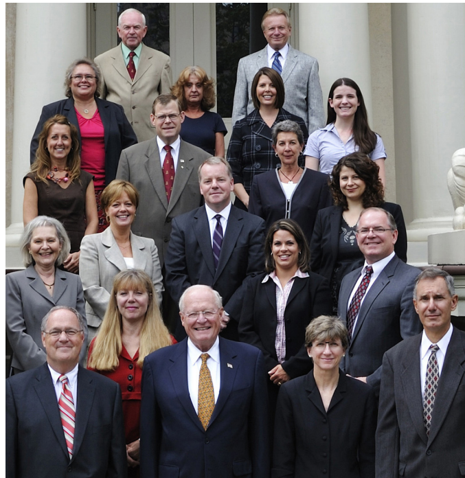
The Lynde and Harry Bradley Foundation Staff