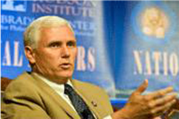
Pence at the 2010 Bradley Symposium

The 2010 off-year elections and opinion surveys suggested that the public is increasingly frustrated with the current direction of public policy. It seems to many that Washington, D.C. is out of touch with the concerns of the American people, pursuing sweeping overhauls of health care, education, and environmental regulation, while ignoring immediate concerns like disappearing jobs and the likelihood of greatly increased taxes to cover runaway government spending. Clearly, liberalism has provoked a populist insurgency against its ambitious plans for making America anew.