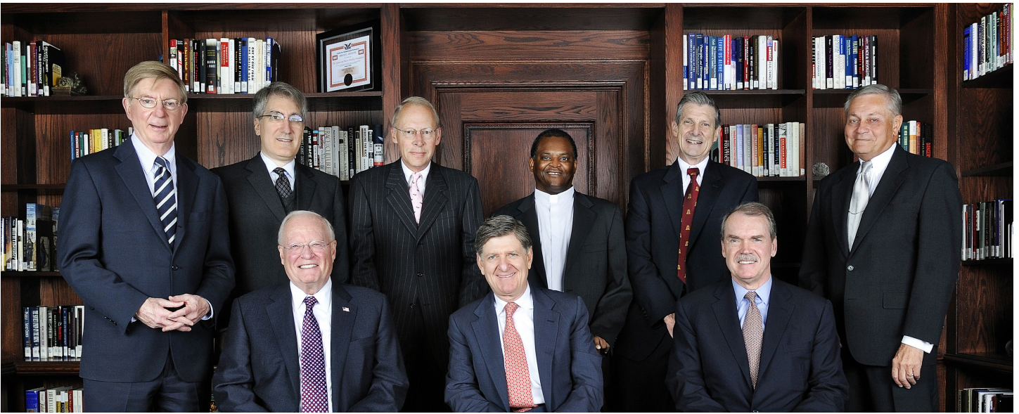
Board of Directors of The Lynde and Harry Bradley Foundation, Inc.