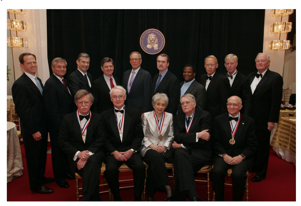
Bradley Directors with the 2007 Bradley Prizes award recipients

experts explored those contemporary trends that are undermining America's understanding of its foundational principles.