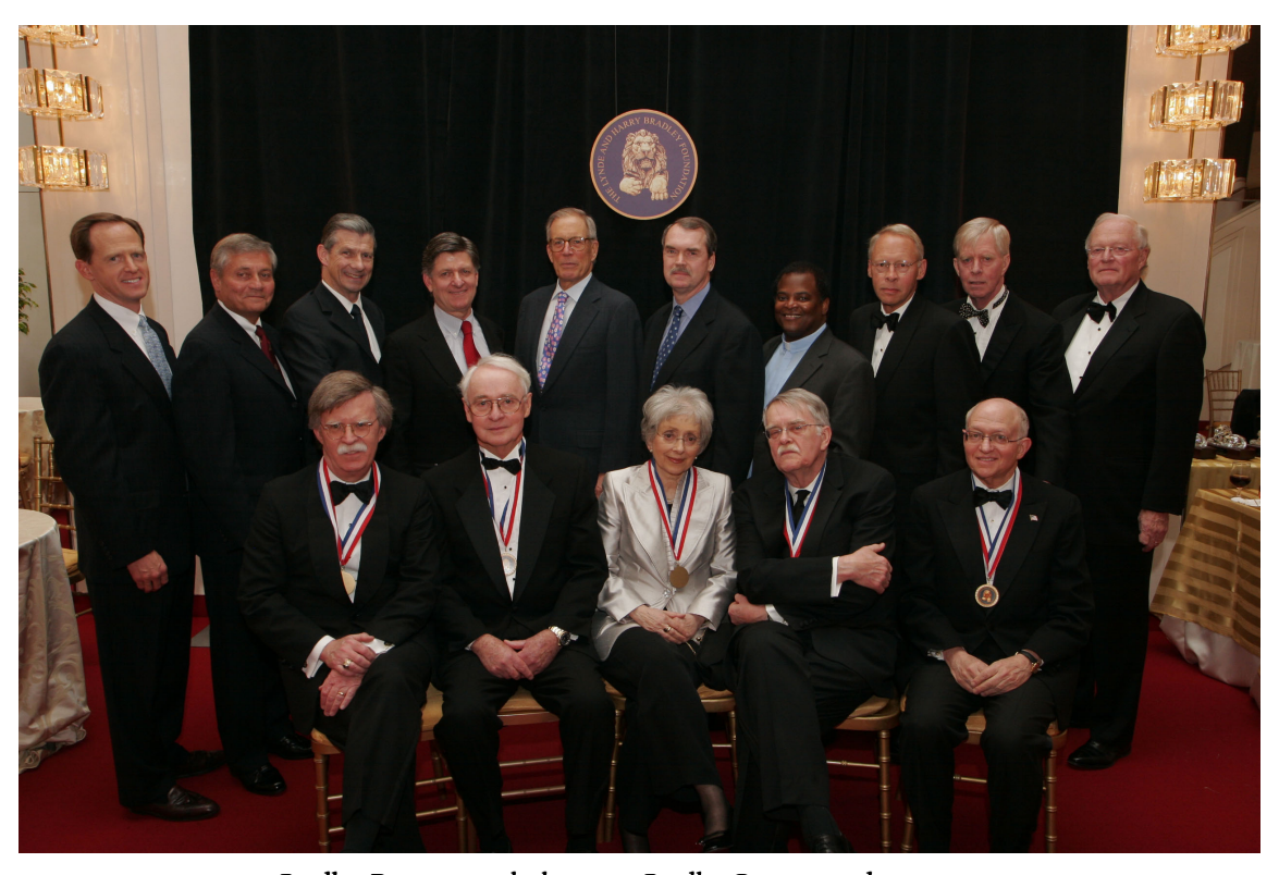
Bradley Directors with the 2007 Bradley Prizes award recipients

conservative intellectuals, commentators, and policy experts explored those паціонану ргошшеш contemporary trends that are undermining America's understanding of its foundational principles.