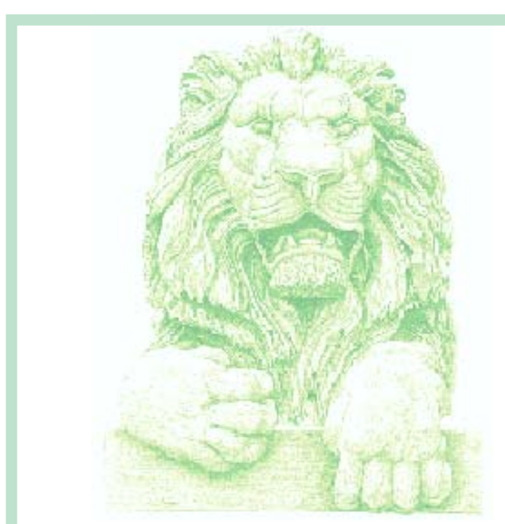
The Lynde and Harry BRADLEY FOUNDATION 2007 Annual Report