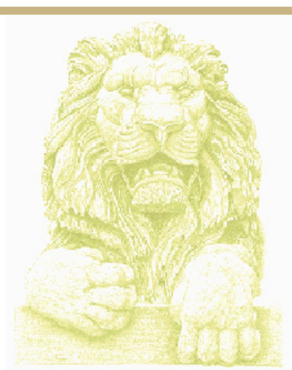
The Lynde and Harry BRADLEY FOUNDATION 2006 Annual Report